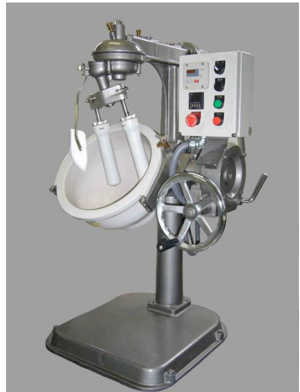
▲ #24R (Porcelain mortar, pestle)

※ Photo shown with options (inverter, digital timer, dust-proof porcelain pestle, Teflon stir board, stainless coating)