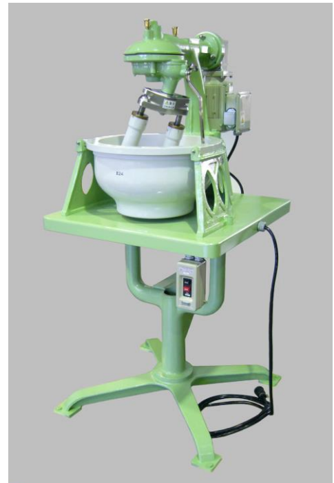
▲#24 vertical type (motor direct-connected)